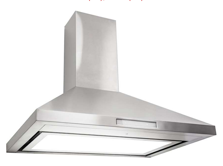
Comes with grey control panel for a monochromatic look

** Available in75 cm (30"), 90 cm (36") Widths