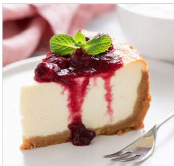
The Water Bath feature is a virtual Bain-Marie for slow-baking custards, cheesecakes, and puddings.