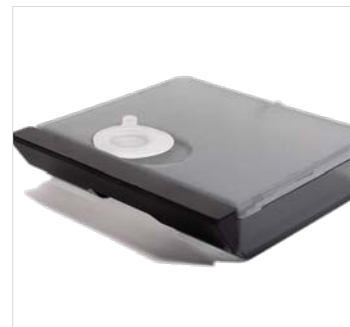
Compact, removable 24 oz. water tank is convenient, lightweight, easy to fill, and easy to access