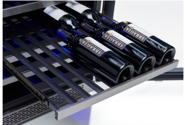
Full-Extension Wood Racks