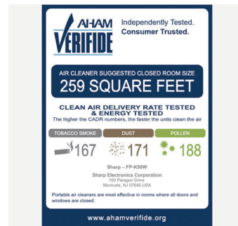
Sharp Air Purifiers are tested by independent laboratories to verify the air-cleaning capability of the filtration system