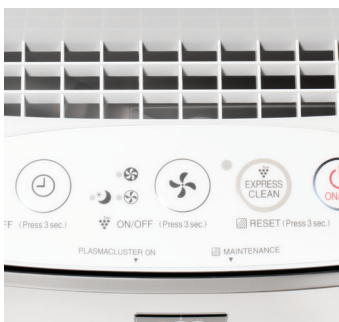
Patented Plasmacluster® Ion Technology reduces germs, bacteria, viruses, mould & fungus

"Plasmacluster Express Clean" gives you sixty minutes of high-density Plasmacluster Ion production and high-fan speed for an extra boost of clean when you need it, and a hands-free return to the prior mode when complete. The unit has LibraryQuiet™ operation (as quiet as 22 decibels, or the sound of rustling leaves) and is ENERGY STAR® rated, so you can run the unit continuously while saving money and energy.